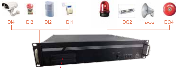
2 x Removable 2.5" Drive Bay