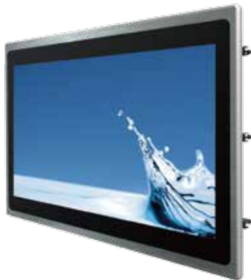
Real Flat Panel Mount (IP65 front side)